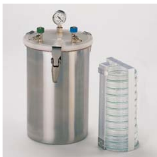
Anaerobic jar 1 with optional Petri dish rack for 10 Petri dishes