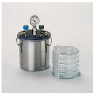
Anaerobic jar 2 with optional Petri dish rack for 5 Petri dishes